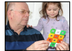
Numeracy, numbers, shapes & colour—Mathematics

and extensive enhanced environment stimulate, encourage and enthral the minds and bodies of all our children.