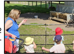
Experiencing the environment and learning about nature

We are currently registered for 12 children by Ofsted (quadruple Outstanding) and hold a Certificate of Lawfulness to conduct this business from our own home issued by Fareham Borough Council.