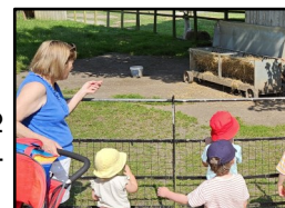
Experiencing the environment and learning about nature

We are currently registered for 12 children by Ofsted (quadruple Outstanding) and hold a Certificate of Lawfulness to conduct this business from our own home issued by Fareham Borough Council.