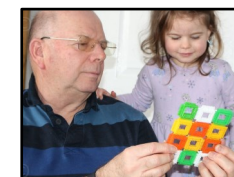
Numeracy, numbers, shapes & colour—Mathematics

and extensive enhanced environment stimulate, encourage and enthrall the minds and bodies of all our children.