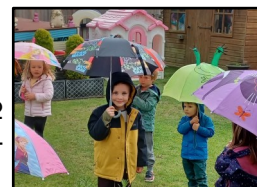
Experiencing the environment and learning about nature

We are currently registered for 12 children by Ofsted (quadruple Outstanding) and hold a Certificate of Lawfulness to conduct this business from our own home issued by Fareham Borough Council.