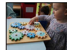
Numeracy, numbers, shapes & colour—Mathematics